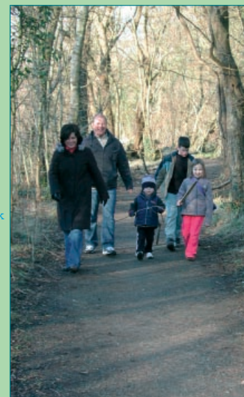
Sourie (New Town Trail)